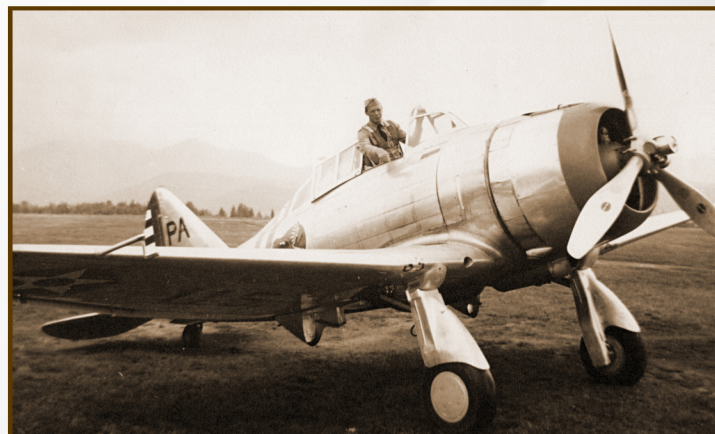
Charles Lindbergh in Lake Placid, 1939